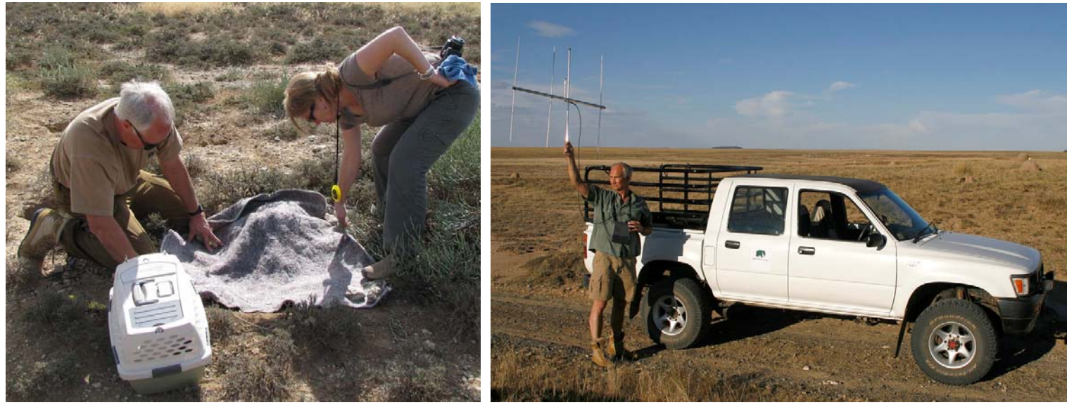
Fig. 9 Releasing male "Okko" into a den (B. Wilson)