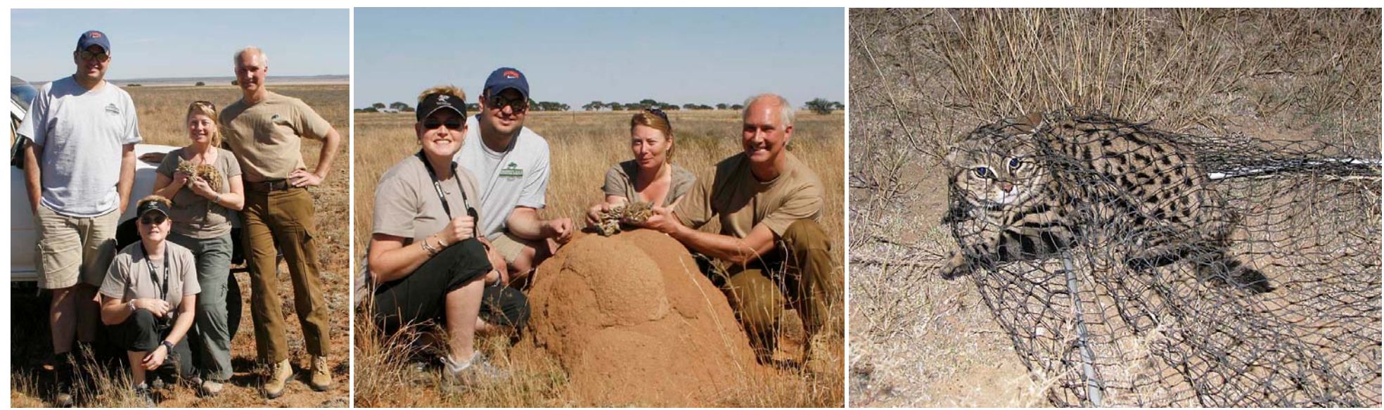
Fig. 7. Capture team with female "Gogo"