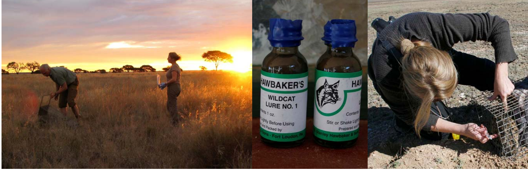
Fig.1. Setting and baiting traps (B.Wilson)

Report surveying and catching Black-footed cats on Benfontein Game Farm, Apr. 21 - 30. 2008 - Sliwa, Wilson, Lamberski, Herrick 2008